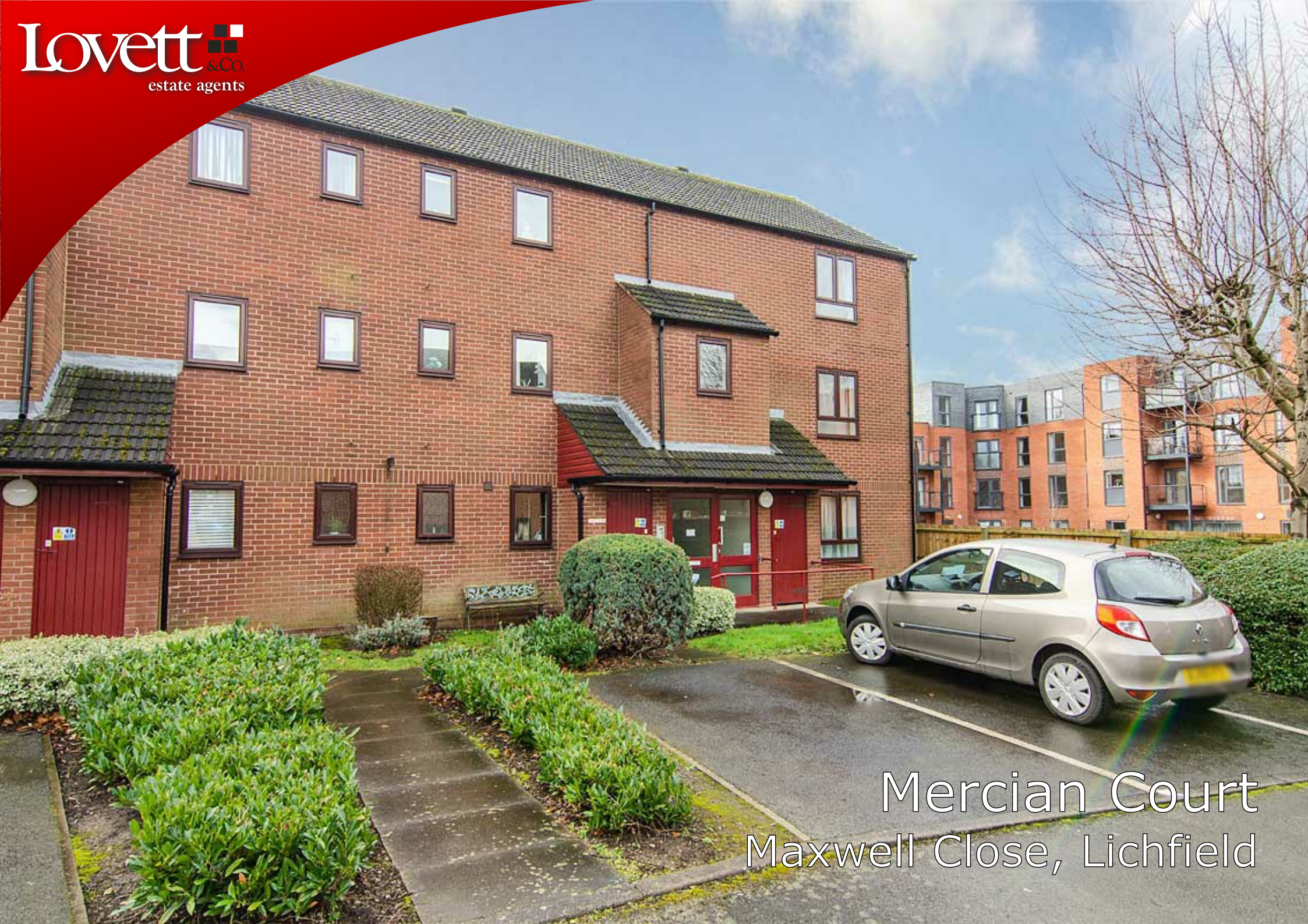
Mercian Court Maxwell Close, Lichfield