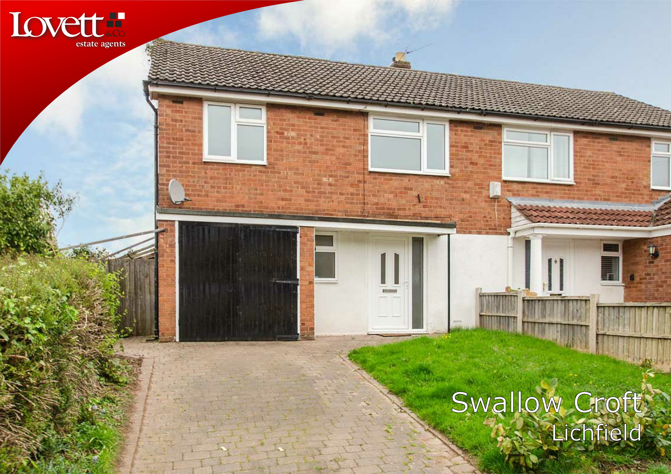
Swallow Croft Lichfield