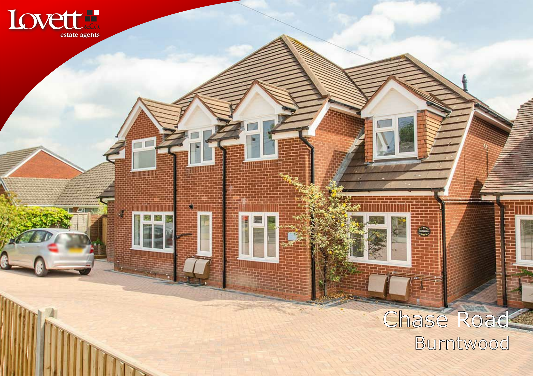
Chase Road Burntwood